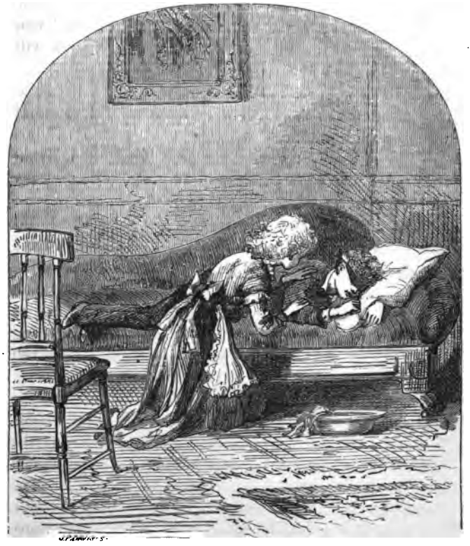
"RUNNING TO THE SOFA, SHE KNELT DOWN BY IT."

pillow, and let me cool it. I don't wonder you feel so, but please don't cry. I'll cry for you; it won't hurt me."